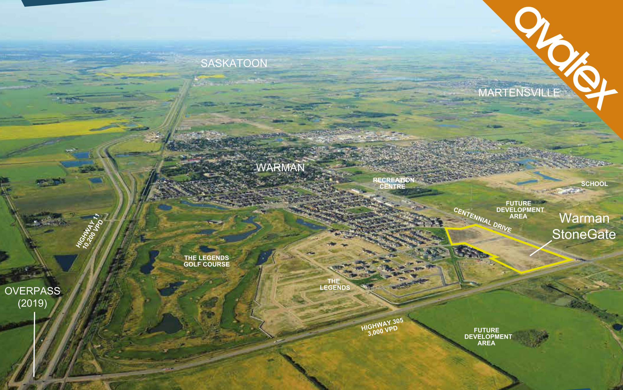
23 acre regional scale shopping center in Warman, Saskatchewan - Construction started 2017